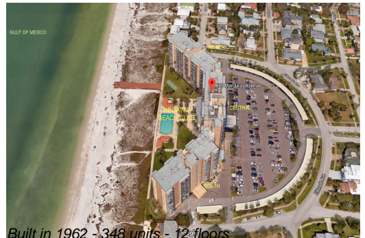
Built in 1962 - 348 units - 12 floors