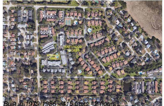
Built in 1979/1986 - 415 units - 2 floors

Number of units: 415 Number of active listings for rent: 0 Number of active listings for sale: 8 Building inventory for sale: 1% Number of sales over the last 12 months: 16 Number of sales over the last 6 months: 8 Number of sales over the last 3 months: 5