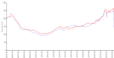
Seminole Isle Townhomes vs Seminole