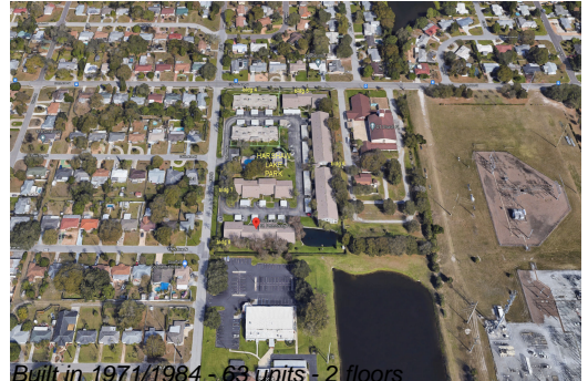
Built in 1971/1984 - 63 units - 2 floors