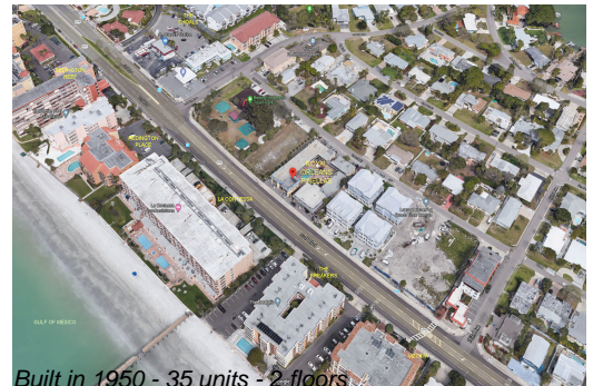
Built in 1950 - 35 units - 2 floors